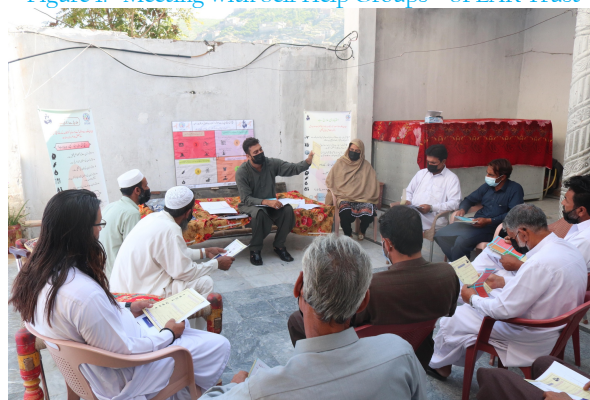
Figure 1: Meeting with Self Help Groups – SPEAK Trust

Most people with HIV do not develop AIDS because taking HIV medicine as prescribed stops the progression of the disease.