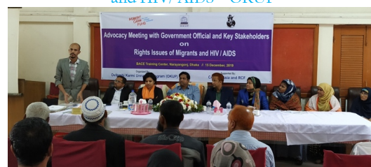
Figure 3: Advocacy Meeting for Rights of Migrants and HIV/ AIDS – OKUP

OKUP also observes World AIDS Day along with government and other key stakeholders at national level. OKUP also celebrates International Migrants Day with national and local government departments. During 2019, OKUP along with other NGOs, government, stakeholders and activists arranged a colorful rally to mark the World AIDS Day 2019. As migrants' health is one of the core programmes of OKUP, the banner for 2019 was: "Migrant Workers Rights are just Human Rights". These events are marked to advocate and remind the stakeholders about migrants' rights and that OKUP is an active organization working for this cause.